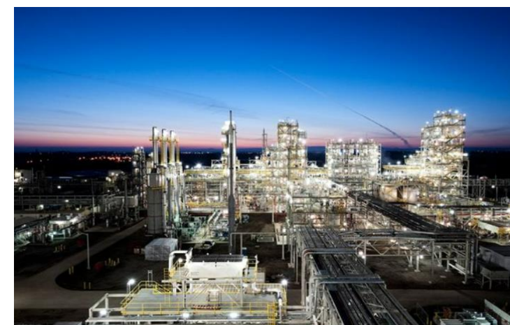
• Manufacturing facility in Moses Lake, Washington, USA